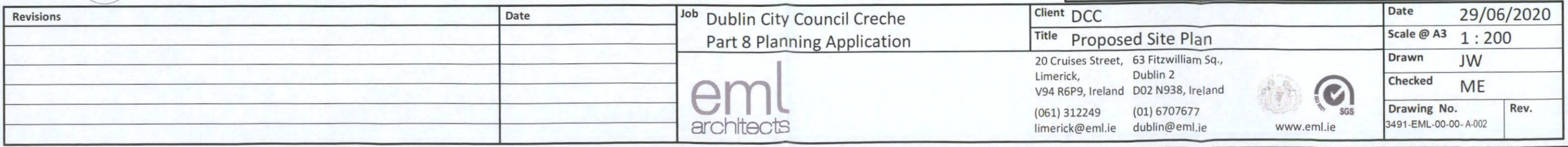
1 Proposed Site Layout 1 : 200

GENERAL NOTES: A. THIS DRAWING TO BE READ IN CONJUNCTION WITH ALL RELEVANT ARCHITECTURAL DRAWINGS THE SPECIFICATION AND ALL RELEVANT STANDARD DRAWINGS. B. THIS DRAWING TO BE READ IN CONJUNCTION WITH ALL RELEVANT CIVIL, STRUCTURAL MECHANICAL AND ELECTRICAL DRAWINGS TOGETHER WITH THE SPECIFICATIONS AND SCHEDULES. C. ALL DIMENSIONS IN MILLIMETERS. DO NOT SCALE FROM THIS DRAWING. USE FIGURED DIMENSIONS ONLY. D. CONTRACTOR MUST VERIFY ALL DIMENSIONS ON SITE BEFORE SETTING OUT COMMENCING WORK OR PRODUCING ANY SHOP DRAWINGS.